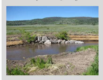
Strawberry River Restoration Project 2015